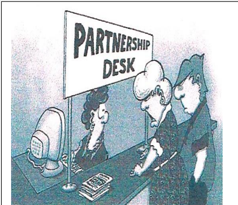
"Do you take trade-ins?"